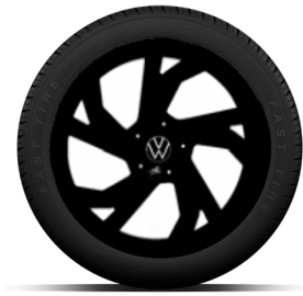
01 18" Black Phantom