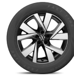
02 18" Slide 20 (machined) alloy wheels (Comfortline)