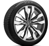
06 21" Braselton alloy wheels (Execline R-Line)