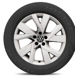
01 18" Slide 20 alloy wheels (Trendline)