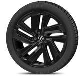
03 20" Capricorn black alloy wheel (Comfortline Alloy Wheel Package)