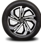
04 20" Rizla (machined) alloy wheels (Highline)