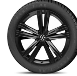
05 20" Trenton black alloy wheels (Highline R-Line Black Package)