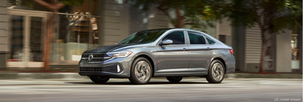
US model shown